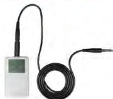
Plug-in to Line-in of MA-707